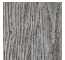
AGED THERMALLY MODIFIED ASH